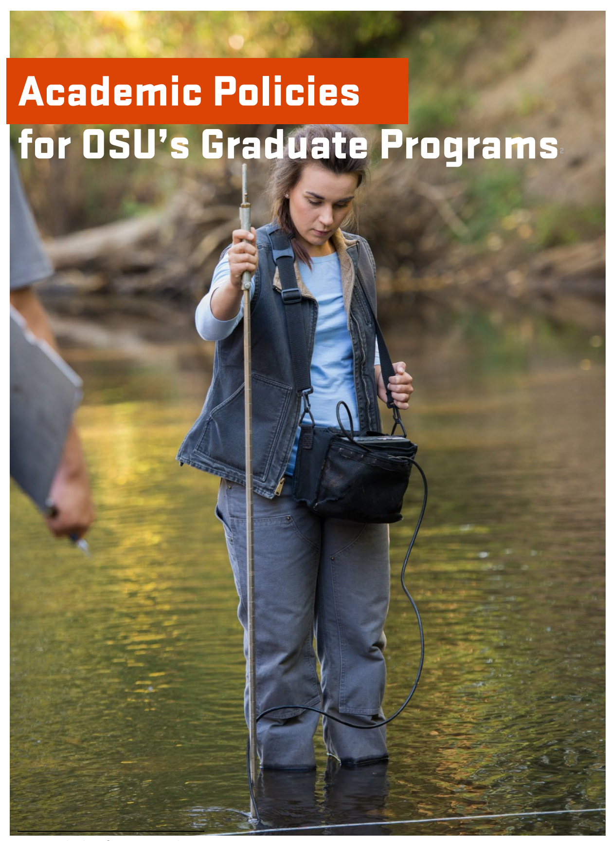
<sup>2</sup> Material taken from OSU websites